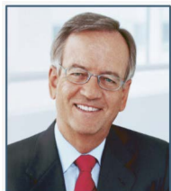
Prof. Dr. Heinrich von Pierer

that give peace of mind in times of crisis. EIM and our managers additionally profit from the wealth of experience of these business leaders with their expertise in restructuring in order to quickly find the necessary solution for your company.